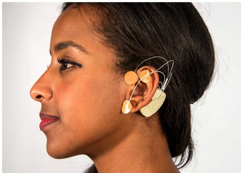
Figure 1. Military Field Stimulator/Neuro-Stim System.

PENFS of the auricle is similar to PENS, but instead of stimulating a certain neurovascular bundle it stimulates the entire ear and all the auricular branches of the cranial nerves, including the vagus nerve. The vagus nerve mediates sensation of the auricular tissue that makes up the ear; therefore, auricular stimulation has been used to modulate its activity and treat pain [16]. Napadow et al have demonstrated short-term relief of evoked pain sensation in chronic pain patients using electrical stimulation of the auricular branches of the vagus nerve [18]. PENFS is based on the idea that a central effect may occur through the creation of a field of electrical stimulation over peripheral branches of cranial nerves, and that this effect can be changed by varying the form, intensity and frequency of electrical current delivered to the neurovascular structures [19]. Animal studies have demonstrated that transcutaneous auricular stimulation of the vagus nerve can have antidepressant effects by stimulating the release of melatonin and serotonin in addition to significantly improving dental pain through the endogenous opioid system [20].