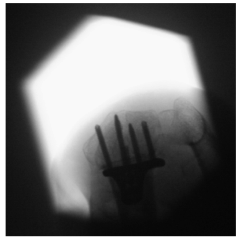
Figure 4. Intraoperative C-arm control: the ankle is shown in anterior-posterior view, free mortise view is achieved with 90° dorsal extension and 20° rotation inside.

Figure 3. Intraoperative tangential view performed to evaluate the length of the screws.