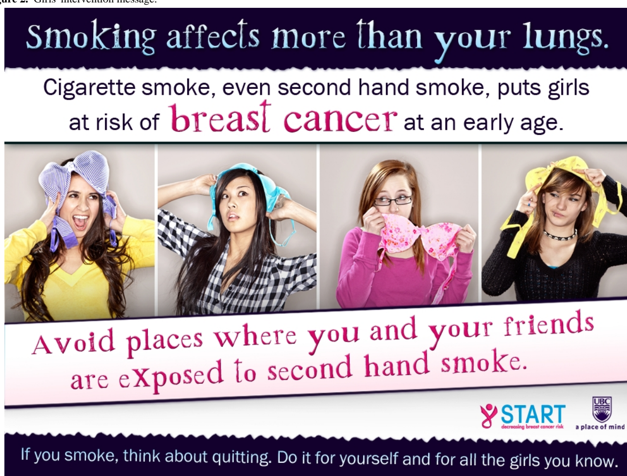
Figure 2. Girls’ intervention message.

Students in the control arm in each target group were presented with a generic gender neutral message that cigarette smoke contains carcinogenic agents. This message included an image of a burning cigarette standing alone against a black background, with the message: “Warning, you’re not the only one smoking this cigarette. The smoke from a cigarette is not just inhaled by the smoker. It becomes second hand smoke, which contains more than 50 cancer-causing agents.” This message content was sourced from Health Canada ( Figure 5 ) [31].