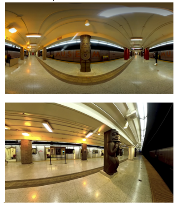
Figure 1. Examples of virtual reality (VR) scenes that may be shown during the VR exposure therapy. Top: Toronto subway station with a few people; equirectangular frame from a 360° VR film. Bottom: A subway that has arrived at a Toronto station with no people around; 360° VR snapshot.

Phase 2 will not involve any data analysis.