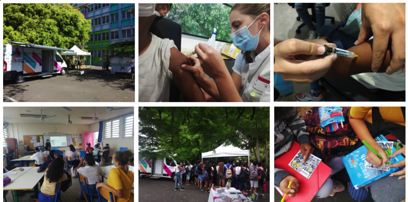
Figure 3. Intervention screenshots.

In the intervention school, of 780 students, 245 were randomly selected in the 12 classes. In the control school, 259 students out of 834 were randomly selected. Analyses are still ongoing, though it seems that this health promotion program offering information to students, parents, and general practitioners and free school-based vaccination had a positive impact on the intervention school and drew many students into the health bus for HPV vaccination.