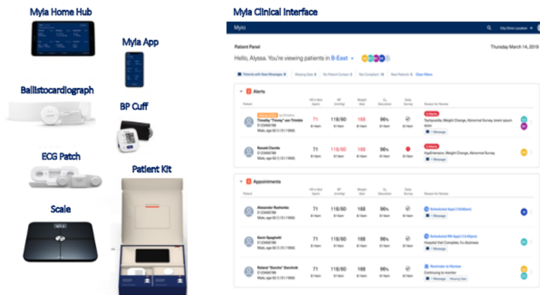
Figure 1. Remote patient monitoring platform used in the Novel Data Collection and Analytics Tools for Remote Patient Monitoring in Heart Failure Trial. BP: blood pressure; ECG: electrocardiogram.