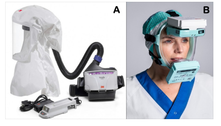
Figure 1. (A) Traditional powered air-purifying respirator (PAPR) and (B) lightweight protective air-purifying respirator (L-PAPR).

A previous study demonstrated that PAPRs mitigate the hemodynamic brain effects induced by the prolonged use of N95 respirators during 12- and 24-hour shifts [7]. In another study, health care professionals indicated a preference for PAPRs over N95 respirators in high-risk settings compared with "usual circumstances," citing comfort, ease of communication, and an enhanced sense of personal safety [3]. A systematic review identified no difference in the contamination of health care professionals by comparing a PAPR with other respiratory protection equipment; additionally, the PAPR was identified as providing greater heat tolerance despite decreased mobility and auditory function [8].