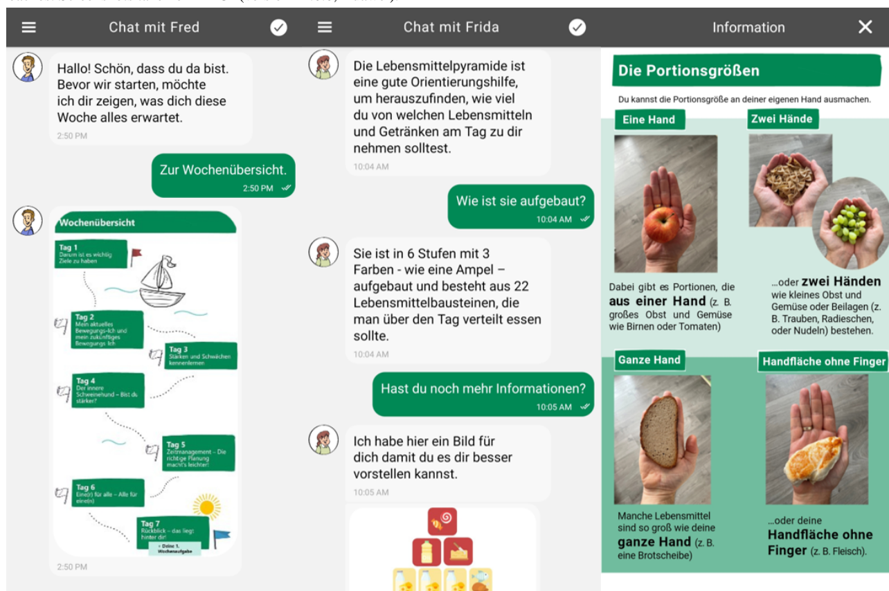
Figure 1. Screenshots of the mobile app. The information in the app is provided as text messages, graphics, and videos or by gamification and storytelling approaches. Screenshots taken on EMUI (version 12.0.0, Huawei).

The intervention content and mobile app were evaluated in a pretest [42]. In the pretest, the long-term unemployed participants (N=12) were asked to test the mobile app for 9 weeks, and feedback was recorded every 3 weeks. The intervention content and mobile app were modified as suggested by the participants.