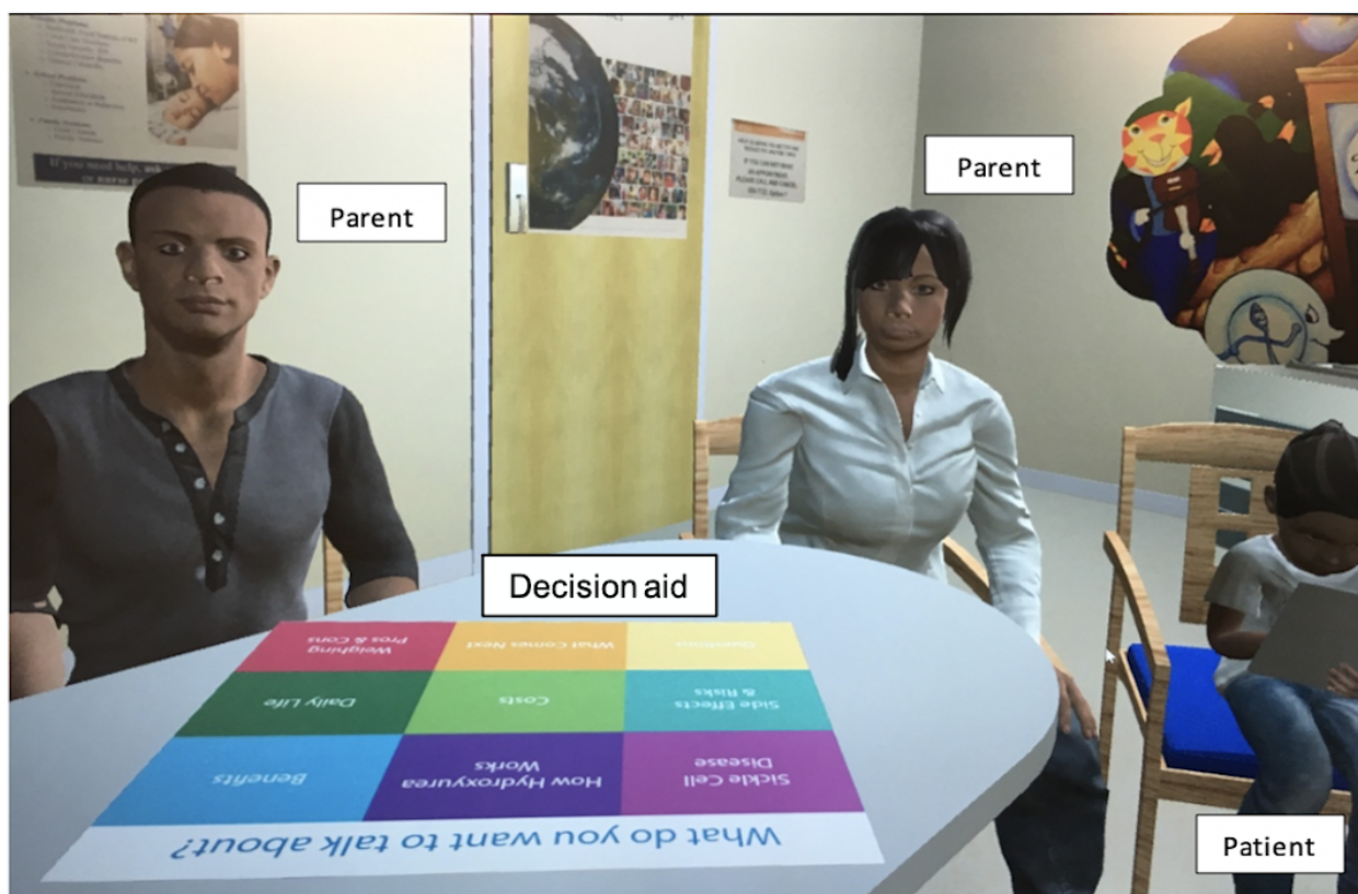
Figure 3. The clinical environment viewed through the virtual reality headset.