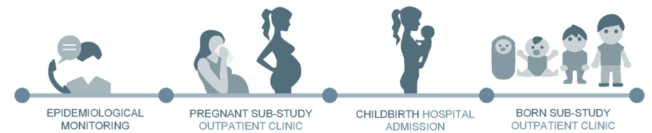
Figure 1. Pregnancy Outcomes and Child Development Effects of SARS-CoV-2 Infection Study follow-up flowchart.

The PREGNANT substudy will follow—until day 21 postpartum—pregnant women who are exposed to SARS-CoV-2 at any phase of gestation and compare them to a control group consisting of nonexposed pregnant women. The BORN substudy will follow the children of the women included in the preceding (PREGNANT) branch. These children will be allocated into two comparison groups (exposed and nonexposed) according to their mothers' in-pregnancy exposure status and will be followed up by a multidisciplinary team of health professionals