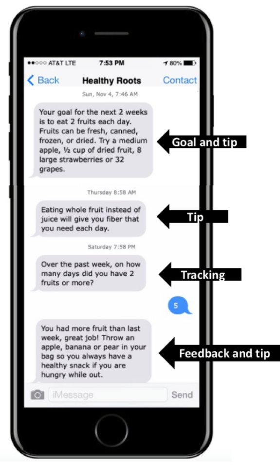
Figure 1. SMS text message exchange showing tips, tracking, and feedback.