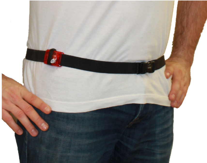
Figure 2. Participant wearing an accelerometer device on top of the right anterior superior iliac spine.