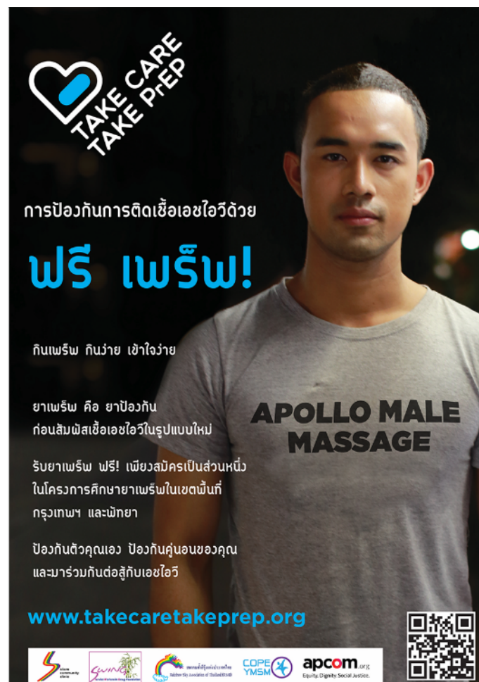
Figure 2. Promotional flier for the Combination Prevention Effectiveness Study for young men who have sex with men and transgender women, Thailand.

Participants who are identified as being HIV-uninfected by rapid HIV testing are prospectively enrolled into the study. Enrolled participants are offered a combination prevention intervention package, with the option to initiate daily PrEP. Prospectively enrolled participants have an initial follow-up period of 12 months; participants who complete their 12-month follow-up period, regardless of PrEP initiation status, are offered the option of further extending their follow-up for another 12 months if the study timeline permits.