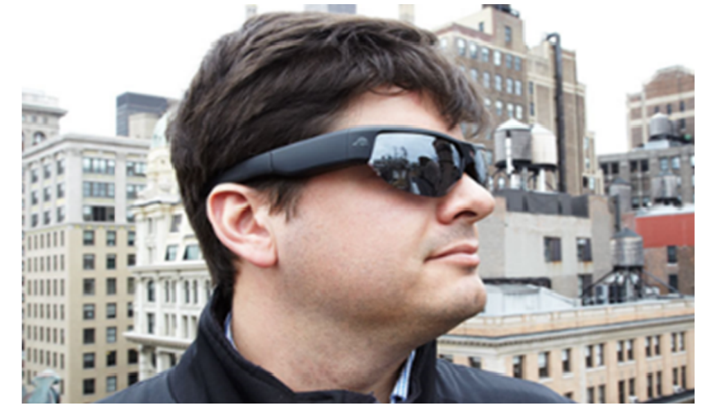
Figure 4. High resolution image taken with Pivothead glasses.

Figure 3. Example of Pivothead sunglasses being worn.