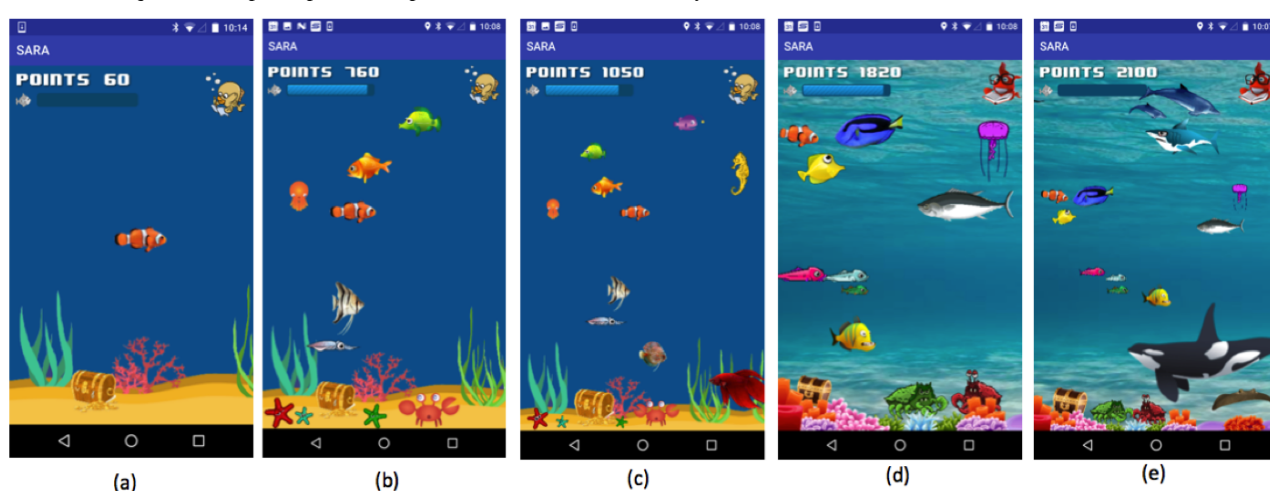
Figure 2. The evolution of Substance Abuse Research Assistant (SARA)'s aquarium environment as data is collected. Panels a, b, c, d, and e respectively show the state of aquarium if a participant self-reports for 1, 7, 14, 24, and 30 days.