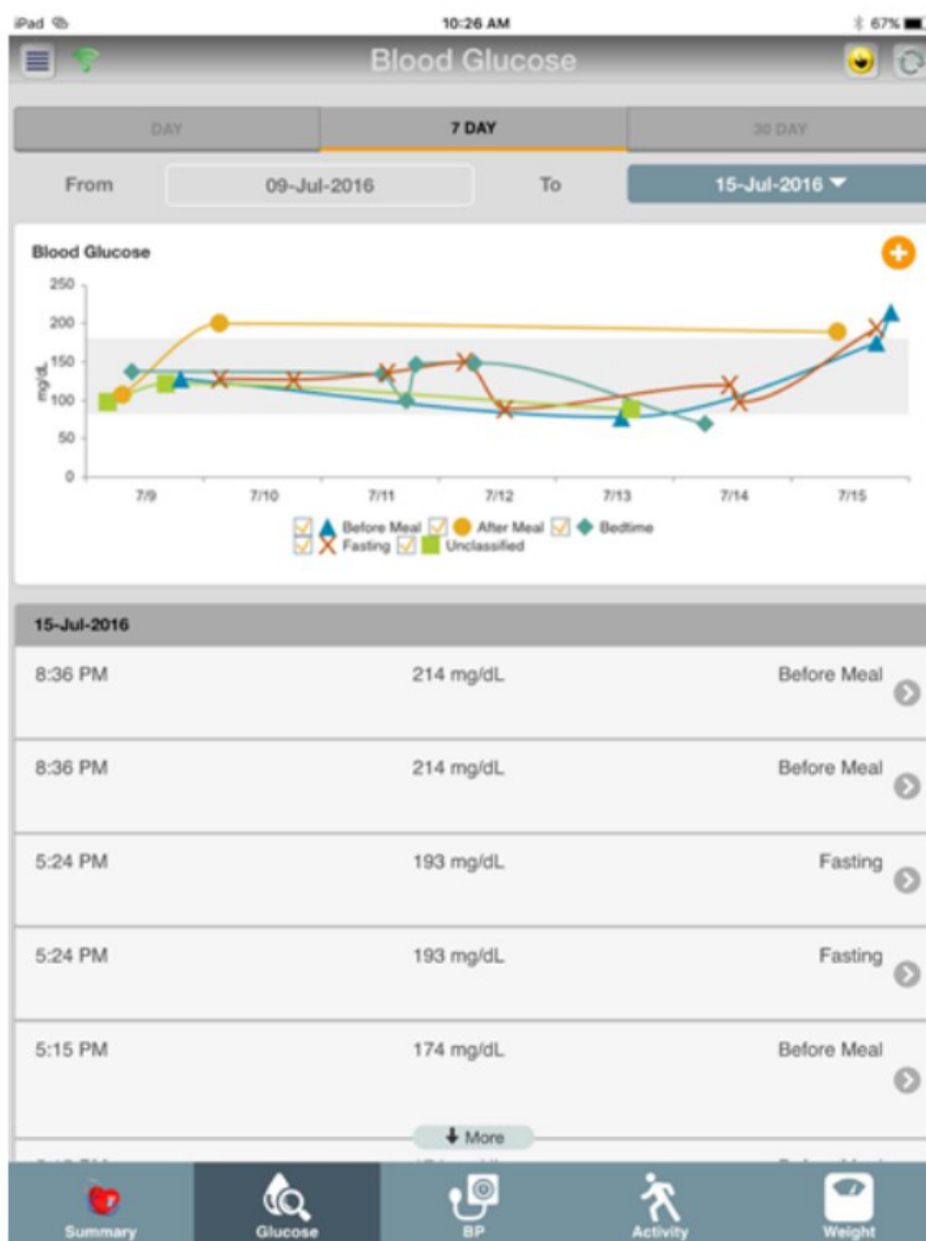
Figure 3. Example of visualization of patient data. BP: blood pressure.