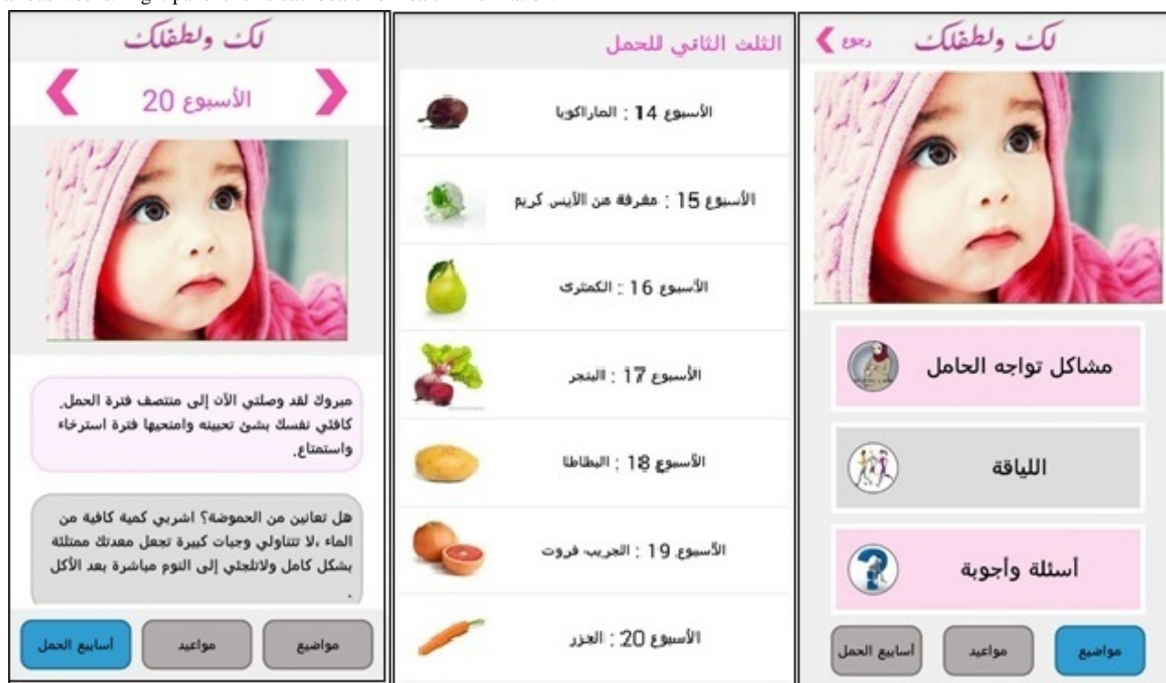
Figure 3. Screen shots from 4 You and Your Baby. Left panel shows message from pregnancy week 20. Center panel shows diagrams of baby's size at various weeks. Right panel shows dashboard for health information.