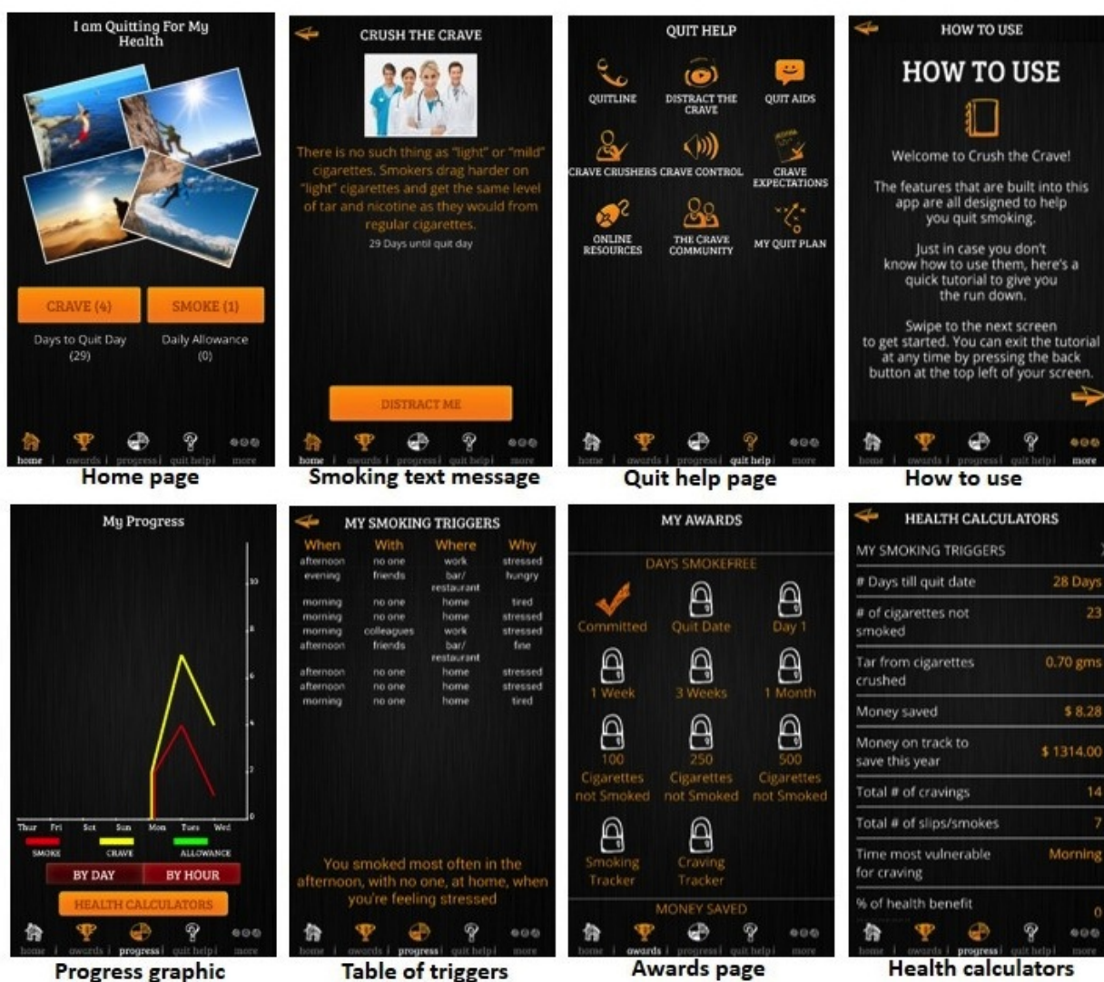
Figure 2. Screenshots of the quit-smoking mobile phone app, CrushtheCrave.

and tabular performance feedback (see Figure 2). The app also provides online distractions to help smokers deal with their cravings. There are social media tools, such as a YouTube channel and opportunities to chat with friends online to distract a user until the craving subsides a few minutes later. Evidence-based information is available for assisting participants during the quitting experience on topics such as relapse and dealing with cravings. Furthermore, data are collected in real time to both support the user and to track the usage of the app allowing for push notifications, helpful reminders, and ongoing data collection. Finally, Crush the Crave provides access to evidence-based cessation services such as smoking cessation quitlines and explains the benefits of, and dispels myths around, nicotine replacement therapy.