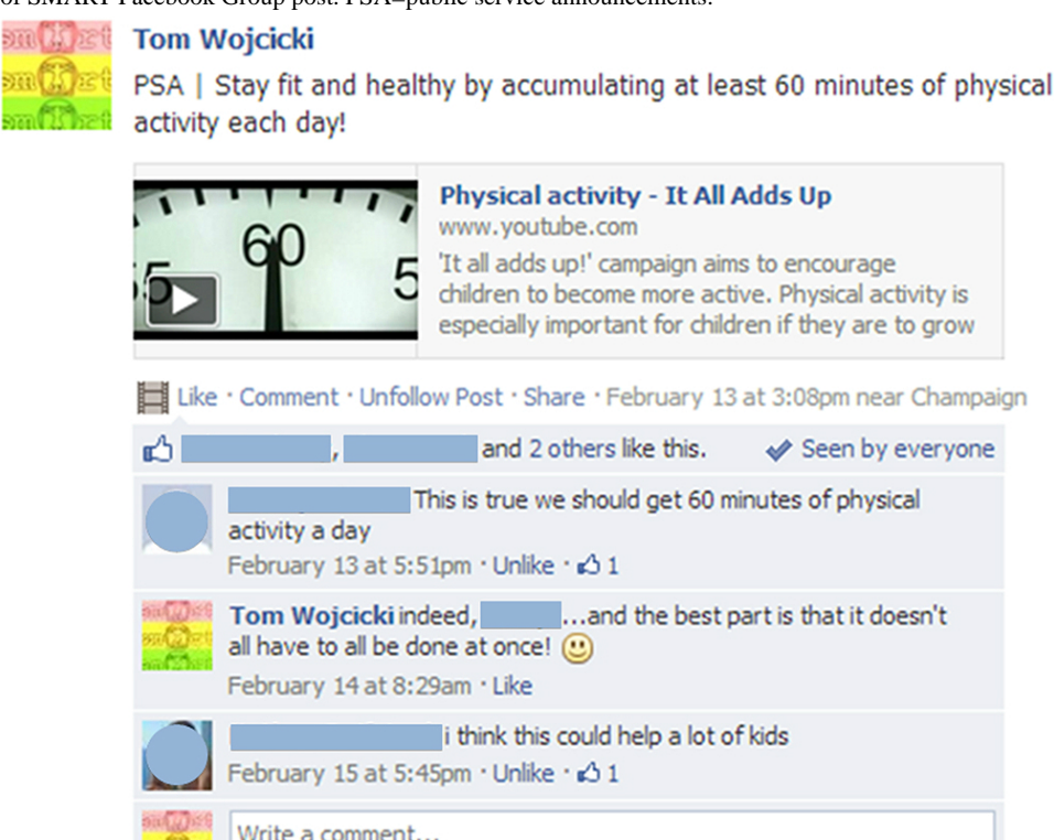
Figure 1. Screenshot of SMART Facebook Group post. PSA=public service announcements.