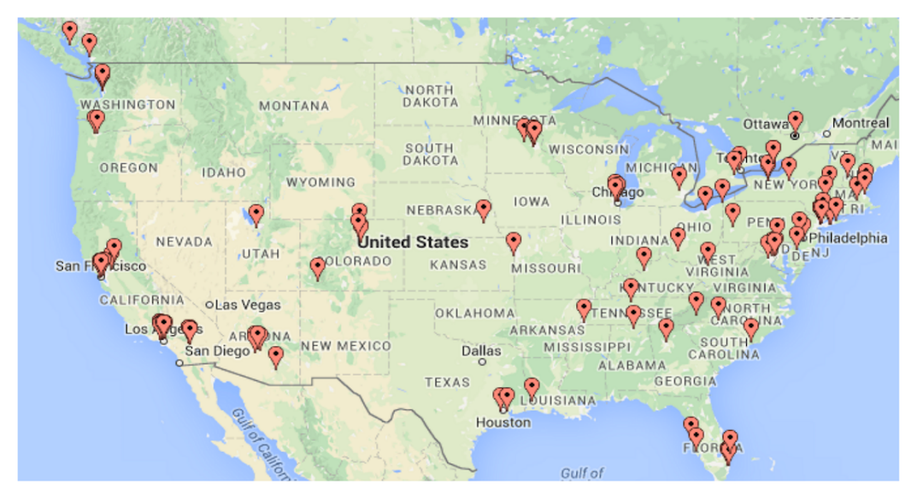
Figure 2. Geographic distribution of the sample (N=193 gay, bisexual, and other men who have sex with men [GBM] prostate cancer survivors).

No compensation was paid to surveys that were identified as spam. When requests for payment were received from respondents whose surveys were identified as invalid/spam, they were informed there was a question about some of their data and asked to call on the 1-800 study line to leave a call back number to verify their answers. This was sent to all the spam surveys, but no one followed through with this request.