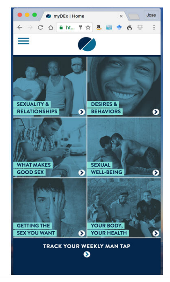
Figure 3. myDEx home screen and navigation instructions.

strategies to improve their sexual communication with partners before, during, and after sex. This session includes how to discuss HIV testing history and status awareness with prospective partners online, how to ensure their physical safety when meeting a new partner, and the value of discussing condoms and PrEP with partners. Session 6 ("Your body, your health") summarizes key messages from prior modules and offer HIV/STI testing resources and PrEP locations in their area. The main menu and final navigation instructions for the intervention is shown in Figure 3.