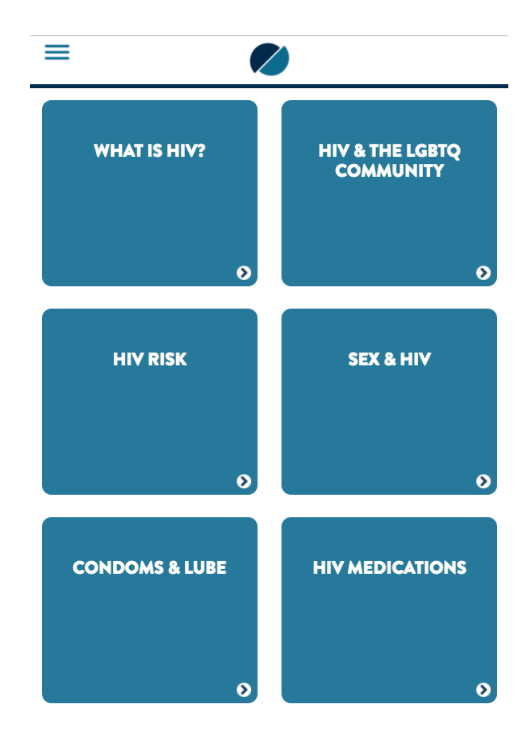
Figure 4. Home screen of the control condition.