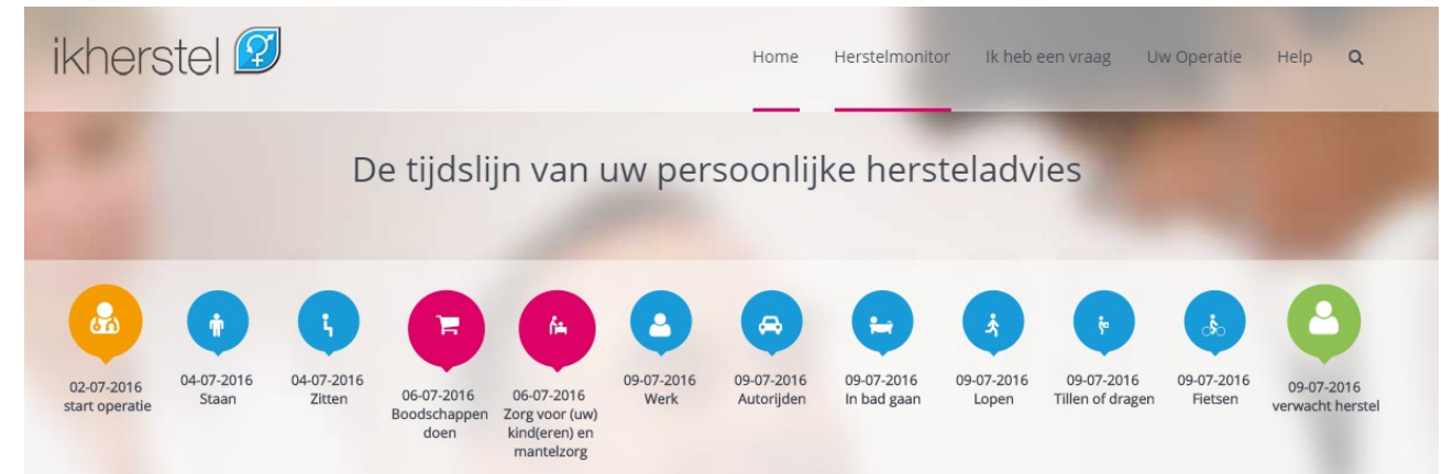
Figure 3. Personalized convalescence plan displayed on a timeline (see Multimedia Appendix 1 for more information).