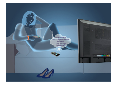
Figure 1. Conceptualization of the MARCHE clinical trial. Study participant (a) receives a motivational message from the OA GO smartphone application and then (b) begins to walk.

The activity monitor and mobile app will allow continuous monitoring of patient activity levels and will be a more objective parameter compared with established and validated scores, such as WOMAC and visual analog scales. Patients with OA may indicate that they would like to be more active and are aware of the benefits of exercise, but that they are limited by pain. Being able to actively, objectively, and continuously monitor activity levels could provide key insights in personalizing patients' treatment regimens.