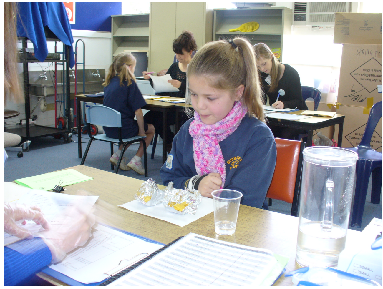
Figure 2. SONIC study participant completing data collection procedures.

<sup>b</sup>Two-paired comparisons, using low/high salt and medium/high salt food variants.