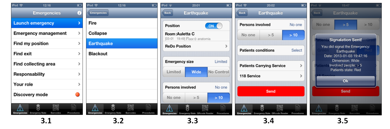
Figure 3. Scenario A: the Emergency Call delivering.

The average time to perform the emergency call (Scenario A) was reduced by 18% (from an average of 57.33 seconds with SD 6.8 seconds, to 48.67 seconds and SD 2.3 seconds), with a higher value of the emergency call quality in terms of data (ie, precision of the emergency location and no missing information, see Table 1). According to Scenario B, once the directions from the Central Station had been received, the rescue team without help from the mobile app started to search for route to the emergency scene more quickly, whereas those with the mobile app spent more time on studying the map first before starting to move. After reaching the emergency location, triage was performed and the patients were moved to the same collecting area (Scenario D). Although medical personnel without the mobile app started to move faster, they took longer to reach the emergency area. Therefore, the total time for all movements (from the start time to the time they reached the emergency scene, but without the time spent on triage which was almost constant for all) showed that the groups with the Mobile Emergency app were much faster (mean time 9 minutes 57 seconds and SD 57 seconds) than those without (mean time 16 minutes 20 seconds and SD 7 minutes 5 seconds). This implies an averaged reduction in the time needed to move into the collecting area of more than 35%.